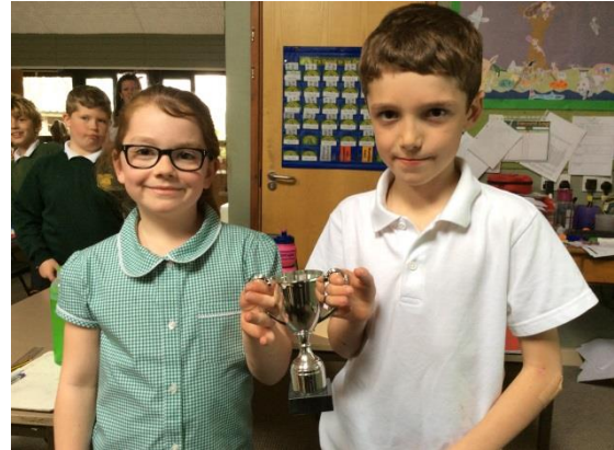
Y5 - Last Week's Attendance Winners.